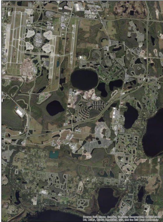
As seen by eye or satellite image